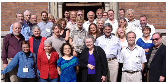
Gathering of scholars at the University of Copenhagen Bateson conference, August 2005